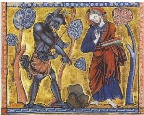
The Temptation of Christ Anonymous, medieval